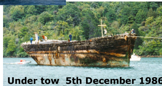
Under tow 5th December 1986

Marlborough trans- chester because the the world's only sur-transport ship and the ing merchant sailing been the subject of a phone call the Chronicle was written. was missed by the